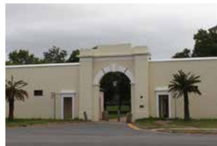
DROSTDY ARCH (SOMERSET STREET)

As part of its 150th birthday celebrations in 2005, the Albany Science Museum opened a Palaeontology Gallery, which provides visitors with a unique glimpse into how the environment and life forms in South Africa have evolved over the last 400 million years. Visit Kirky, the first African dinosaur with an isiXhosa name, and marvel at the size of the stegosaur found in the Bushman's River Valley. The Museum also has comprehensive permanent exhibitions on the Solar System, a bird gallery, a mammal gallery, a "touch and hear" children's gallery, and the old-world Hewitt Gallery.