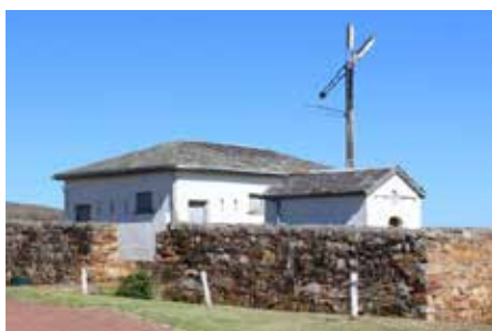
FORT SELWYN (MONUMENT GROUNDS)

The Drostdy Arch was built in 1842 as the gateway and guardhouse for the Drostdy and military barracks which were located where Rhodes University is situated today. The Drostdy Arch contains a coffee shop and craft shops.