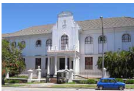
ALBANY SCIENCE MUSEUM (SOMERSET STREET)

Permanent exhibitions at the Albany History Museum include a display of contact and conflict on the eastern frontier in the 18th and 19th centuries, the popular 1820 Settlers Gallery, and an exhibition on the history of clay.