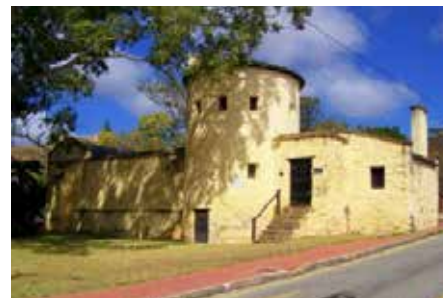
THE PROVOST (LUCAS AVENUE)

The Observatory Museum contains exhibitions on the role of Grahamstown in the Anglo-Boer War and the story of the discovery of diamonds in South Africa. Of great interest to national and international tourists is the only working Victorian camera obscura in the southern hemisphere. Climb the winding staircase to the turret in the tower, and find the town doctor in the mirrored images of Grahamstown reflected on a circular table.