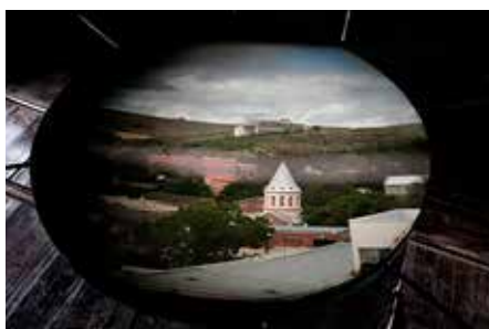
OBSERVATORY MUSEUM (BATHURST STREET)

The seven-pointed star fort was built on Gunfire Hill in 1836 but was never involved in any military action. The semaphore mast was intended as a signalling system, connecting the town with Fort Beaufort and Fort Peddie. Visitors by appointment only. Contact the Albany Museum on 046 622 2312.