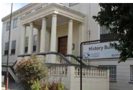
ALBANY HISTORY MUSEUM (SOMERSET STREET)

Permanent exhibitions at the Albany History Museum include a display of contact and conflict on the eastern frontier in the 18th and 19th centuries, the popular 1820 Settlers Gallery, and an exhibition on the history of clay.